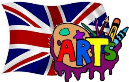
ART IN ENGLISH