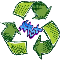
ART & RECYCLING