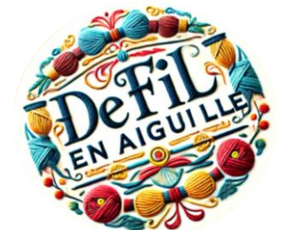
DE FIL EN AIGUILLE