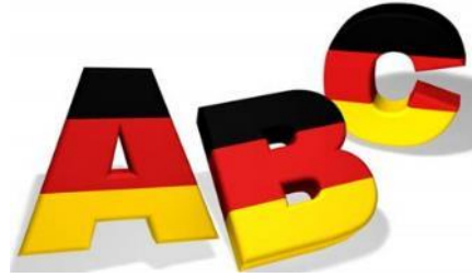
PARLEZ-VOUS DEUTSCH ?