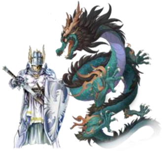
DUNGEONS & DRAGONS

Please make sure to identify the posters that correspond to the activities your child is enrolled in, and kindly remind them of the day and the poster associated with each activity.