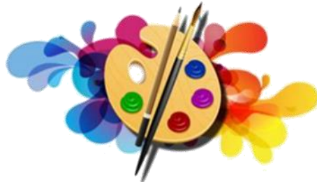
PEINTURE & DESSIN