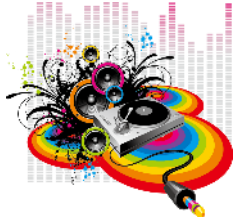
KIDS MIX CLUB