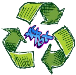
ART & RECYCLING