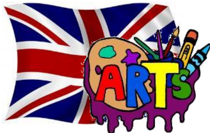
ART IN ENGLISH